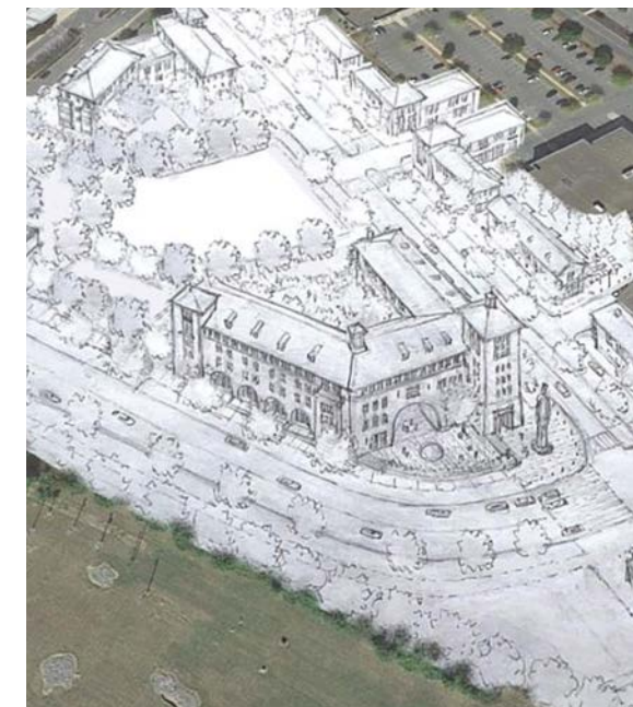
Concept rendering of a similar town center