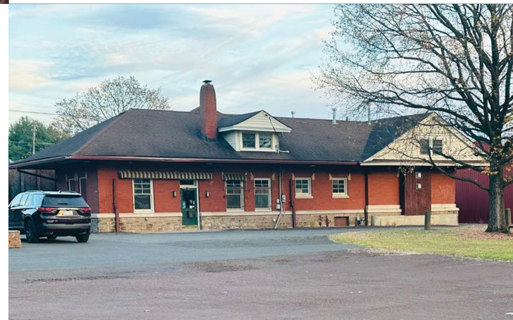
The train station underwent meticulous cleaning and preparation, transforming it into a blank canvas for potential tenants.

Residents and businesses, your voice matters. Take an active role in shaping the future of Hatfield by participating in town hall meetings and completing the surveys. Be on the lookout for more information. Your input is vital to building a vibrant and flourishing town together.