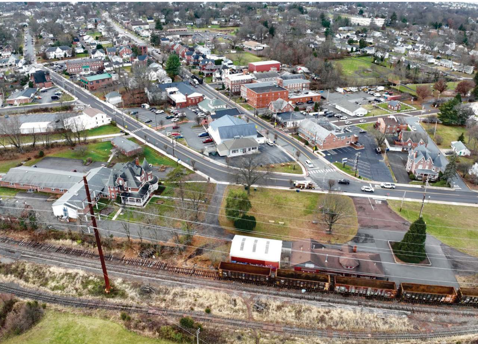
The collaborative approach extends beyond the train station project.